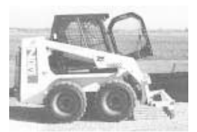
Moldboard plow shears are spaced about 1 ft. apart on subsoiler.

Contact: FARM SHOW Followup, Ron Zunberger, 1353 CR 23N, Quincy, Ohio 43343 (ph 937 585-9147).