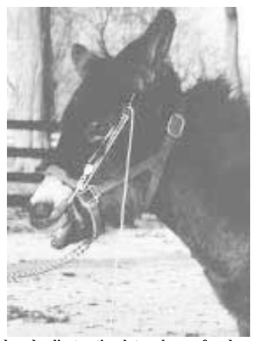
"Stableizer" puts pressure behind ears and under lip to stimulate release of endorphins. It calms horses, mules and donkeys so you can work on them.

much better that they no longer need the restraint of the Stableizer.