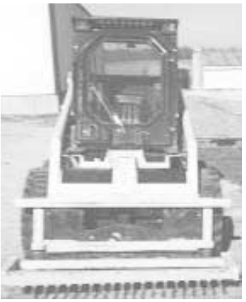
Rake spikes are made of 5-in. long steel tines off an old harrow.