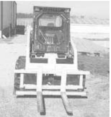
Forks are standard 3-ft. long pallet forks.