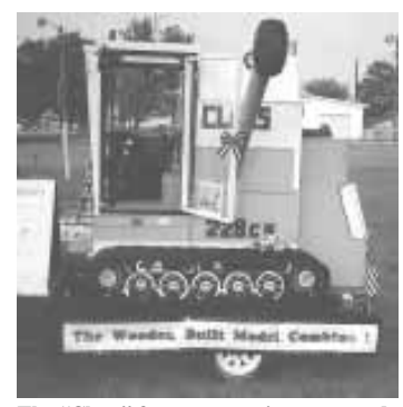
The "Claas" features a grain auger made of a cardboard tube and rubber tracks off a Case-IH skid steer loader.

The 5-ft. high by 3-ft. wide sides of the combine fold down to just 34 1/2-in. high on each side. The driver's side has actually a 5in. dia., 10-ft. long grain auger - a cardboard tube donated by a local carpet outlet - extending out at a 45 degree angle. A grain spout is fashioned from a 14-in. long plastic pretzel can and is painted black. The auger system has a flood light that runs off one of two