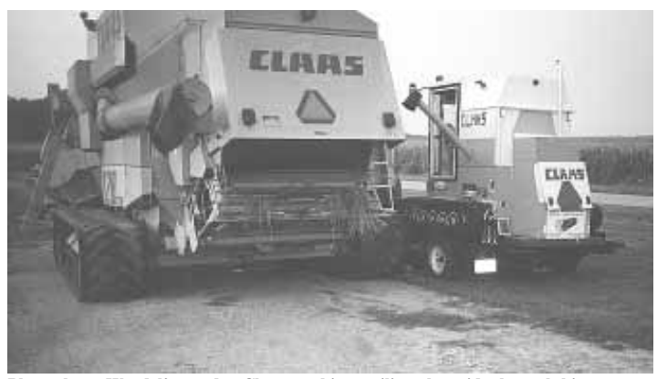
Photo shows Wendel's wooden Claas combine trailing alongside the real thing.

Contact: FARM SHOW Followup, Avery K. Sahl, 3823 Shera Bay, Regina, Sask., Canada S4S 7E5 (ph 306 586-8149).