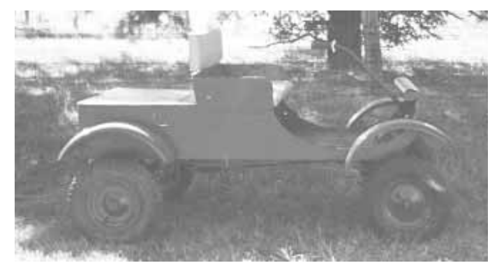
Powered by a 3 1/2 hp Kohler engine, Krueger's go-cart hits speeds of up to 10