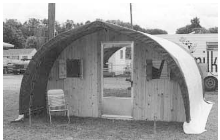
Kit lets you install either canvas or wooden ends, with the customer installing his own