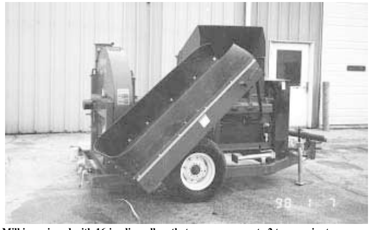
Mill is equipped with 16-in. dia. rollers that can process up to 2 tons a minute.

Contact: FARM SHOW Followup, Alan Kennedy, Box 10, Miami, Manitoba, Canada ROG 1H0 (ph 204 435-2101).