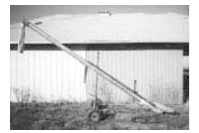
Auger was originally designed to attach to side of gravity flow wagon. Coutant mounted it on wheels and equipped hopper with a metal tongue so he can pull it behind his pickup or wagon.

Wheels are hinged on axle so they can be turned sideways, allowing auger to pivot and cover the entire length of the drill.