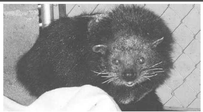
A member of the weasel family, Binturongs have eyes, whiskers, and pointed ears like a cat.

Contact: FARM SHOW Followup, Dexter Farm Equipment, 606 North Sparta, Wataga, Ill. 61488 (ph 309 375-6661).