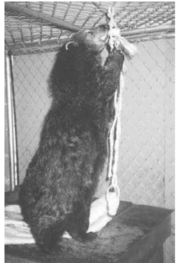
Binturongs often stand on their hind legs

The Binturong is mainly a tree dweller..