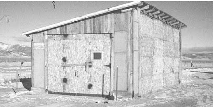
A pair of kerosene lanterns keeps the temperature inside shed above freezing in even the coldest weather.

Contact: FARM SHOW Followup, David Huffer, 6620 Holter Road, Middletown, Md. 21769 (ph 301 371-6639).