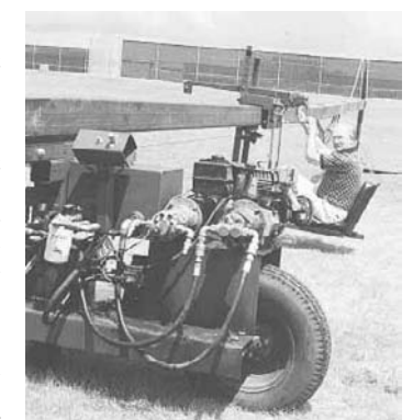
"Garden Master" is built like a mini center pivot irrigation system.

A standard reel holds up to 1/4-mile of 15in. dia. pipe which it will roll up in just 10 minutes. Custom built rollers are available for larger pipe, as well as an optional split 18 • FARM SHOW