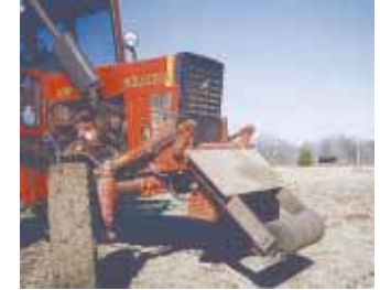
Homemade bale unroller consists of a freely rotating steel cylinder. To unroll bales he simply lowers the unroller and then drives ahead.

"The unroller consists of a freely rotating steel cylinder. To unroll bales I simply lower