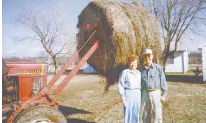
Bale handler will stack 1,000-lb. bales two high with no problem, says Mackey.

Contact: FARM SHOW Followup, Otto Mackey, Rt. 3, Box 130, Okemah, Okla. 74859 (ph 918 623-1473).