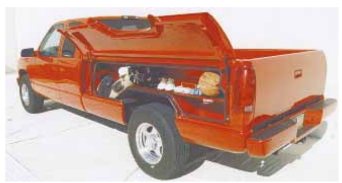
Locking side panels flip up to provide 20 cu. ft. of storage on the 6 1/2-ft. box and 27 cu. ft. on the 8-ft. box.