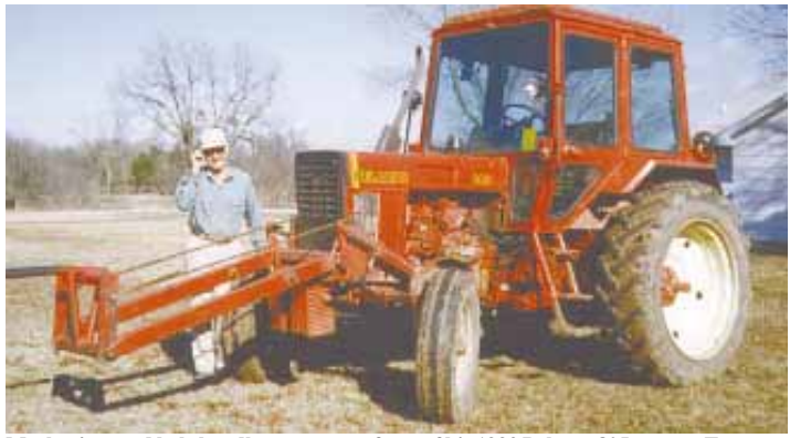
Mackey's round bale handler mounts on front of his 1992 Belarus 805 tractor. To transport and stack bales, a pair of 8-ft. long steel arms attach to 1 1/2-ft. long arms that are hinged just in front of the radiator and are raised or lowered by two cylinders.