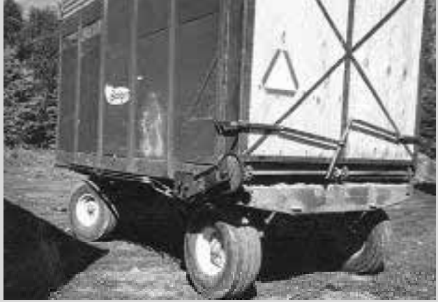
Converting his forage wagons to rear-unloading should give them another 20 years of life for use with his bunk silos, Gran says.

place 32,000 sq. ft. of metal flooring with concrete. We only work on the project during winter, installing up to 40 slats a day. The 3-wheeled machine is powered by a rearmounted 5 hp Kawasaki engine. It has hydrostatic drive and a rear platform for an operator to stand on. It has two stabilizer arms on the side that extend when picking up concrete slats with the boom. We usually use 4 by 8-ft. slats weighing 1,200 lbs. apiece but it'll handle slats up to 10 ft. long. Height is just under the 86 in, of our doorways. It steers with a rod attached to the front tire. Rear tires are foam-filled 10-in. tires. Custom-building the cart cost $4,000 from a nearby manufacturer of TMR mixers. (Amos L. Hoover, RR 1, Box 80, Blain, Pa. 17006; ph 717 536-3458).